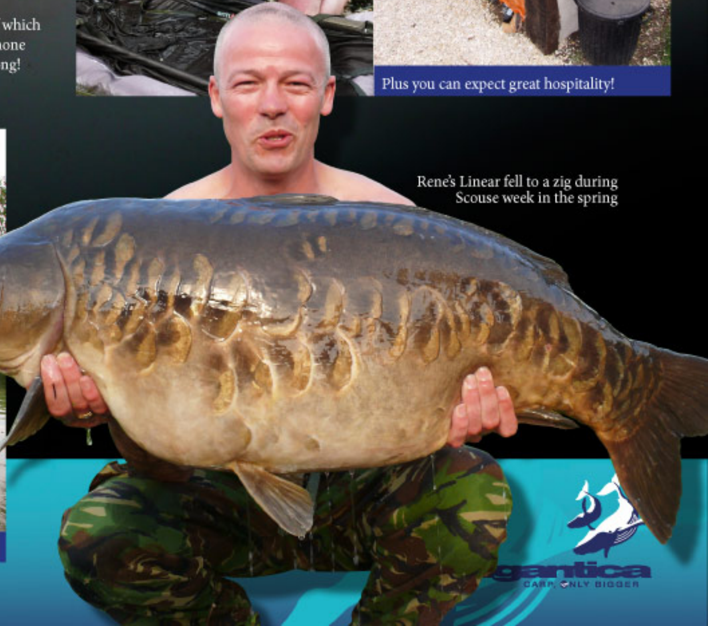
Rene's Linear fell to a zig during Scouse week in the spring