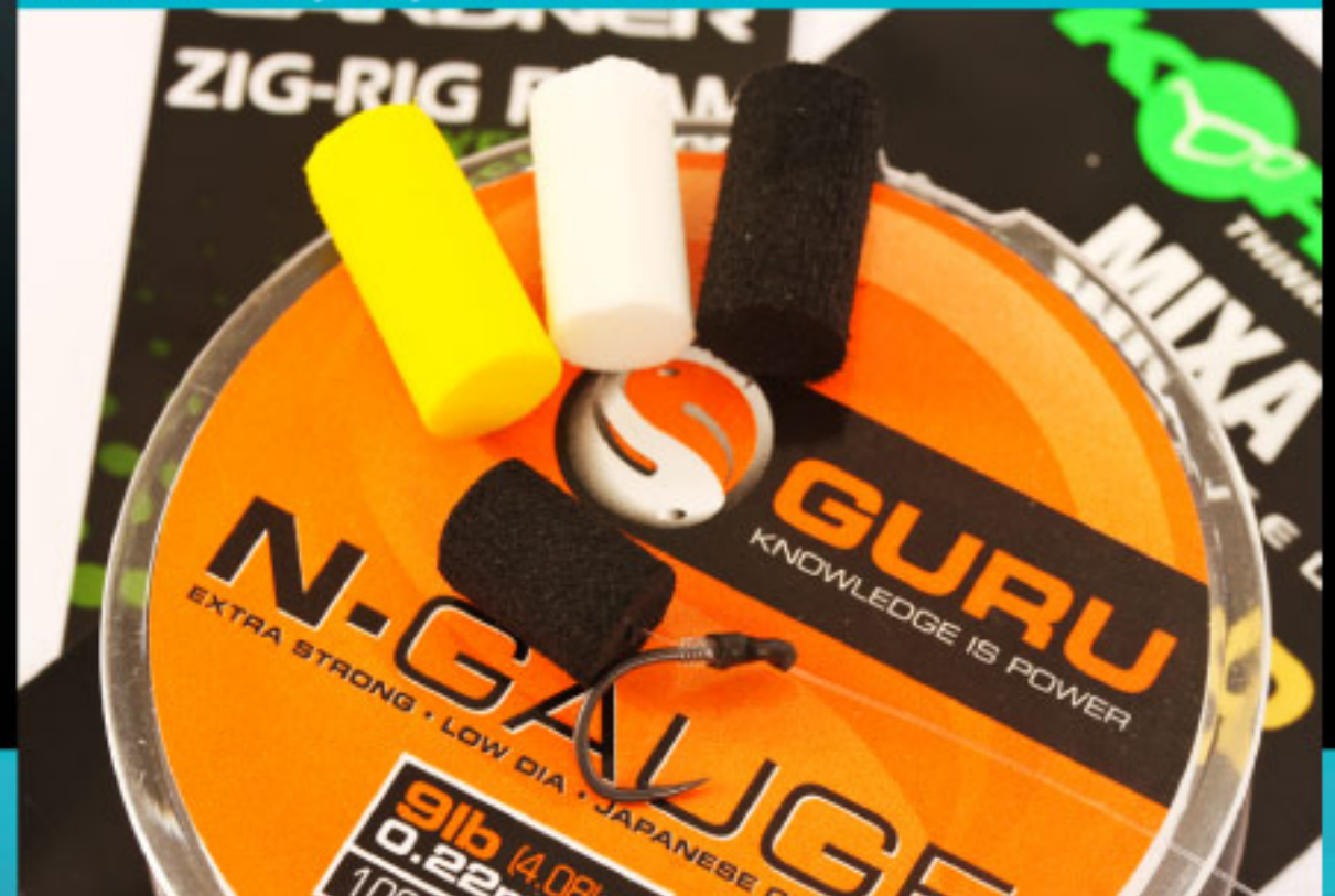
Far more came out on zig rigs this year simply because far more people used them.