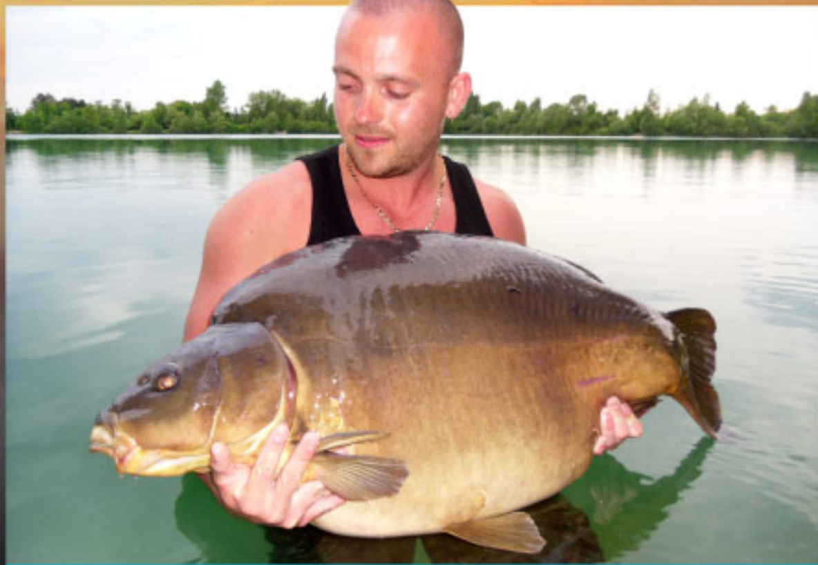
Split Pec is cradled for one last picture.