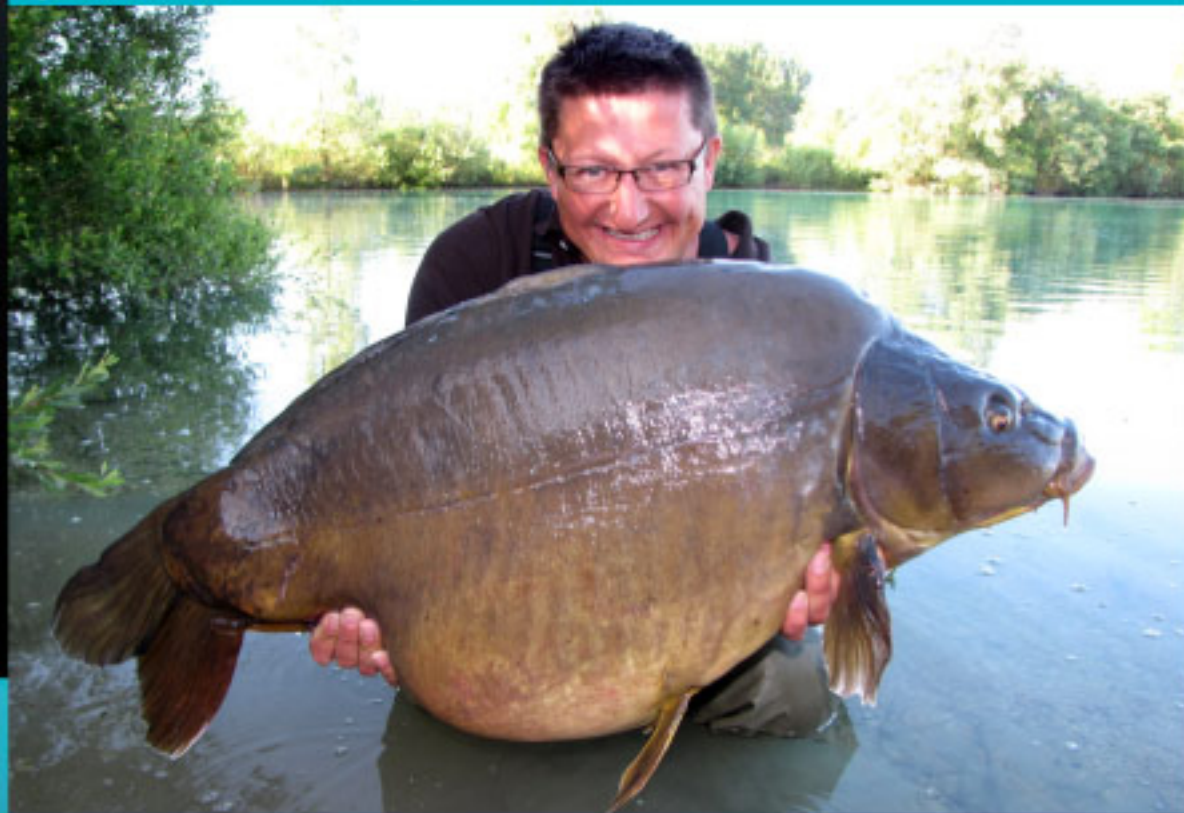
Rapunzel, a fish we had no record of. How many more are there like this one?

land the fish if the hook link is 20 feet long. With the water up at a very high level 20 feet of link puts the small foam hook bait about two feet under the surface in most swims. Adjustable zigs also work but I think in the clear water a super-long hook link is better because it can be cast further and is harder to see underwater.