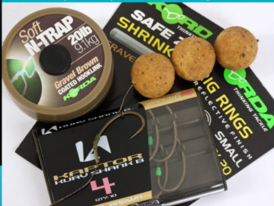
A running lead coupled with these rig components are Danny's usual approach.