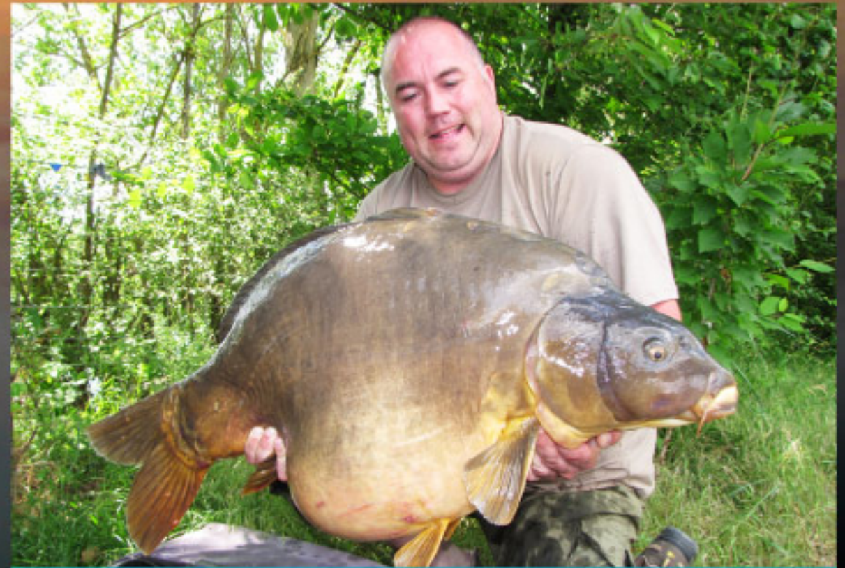
Discus is one of the growing head of fifties in the lake.

Twenty foot hook links of 10lb Kruiser Line with a tiny piece of black and/or yellow foam to a size 12 Wide Gape B is the way to do it. Lay the rig behind you on the gravel and forget it's 20 feet long, that's my advice. As long as you feather it before the lead hits the surface it will not tangle. I fish to dump the inline lead by fishing the line outside the lead, it casts really well and playing fish feels great with no lead on, you still need a mate to