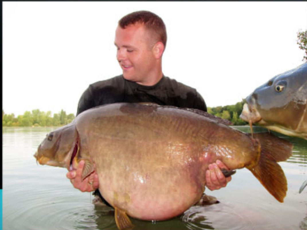
Drop Tail is a sought-after fifty pounder.